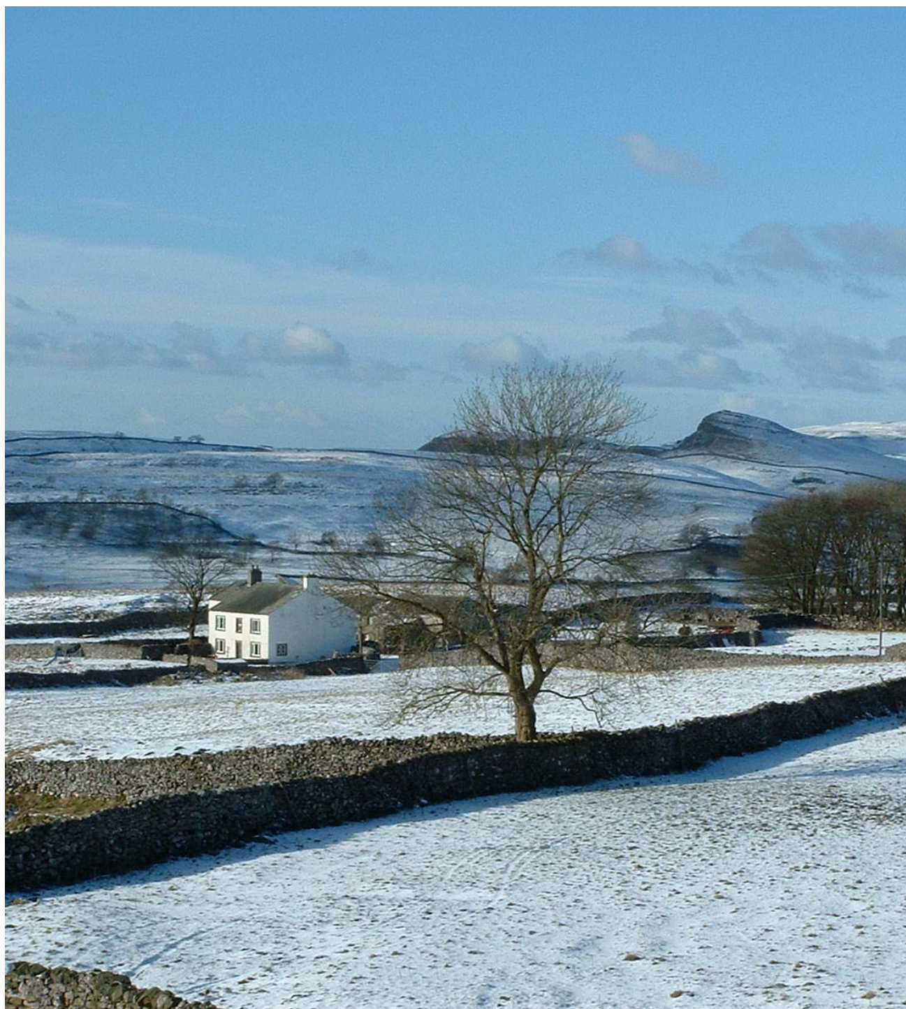
Lower Winskill farm in winter